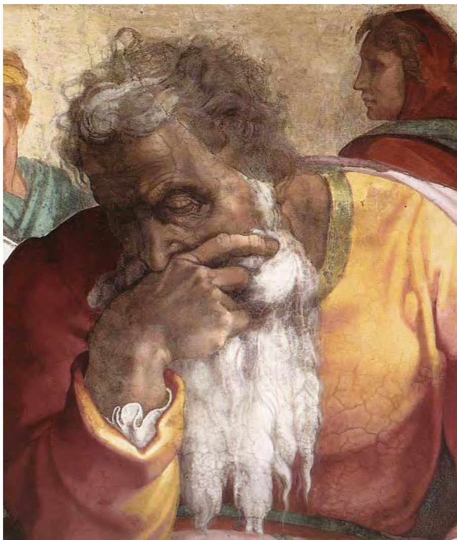
Michelangelo's depiction of the prophet Jeremiah (Sistine Chapel)

E-Mail Address: StFrancisXavier@sfxavier.org • Website: www.sfxavier.org