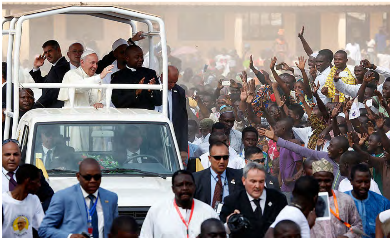
Pope Francis bringing a message of peace and reconciliation to warring Muslims and Christians in Bangui, Central African Republic, on the First Sunday of Advent.

E-Mail Address: StFrancisXavier@sfxavier.org • Website: www.sfxavier.org