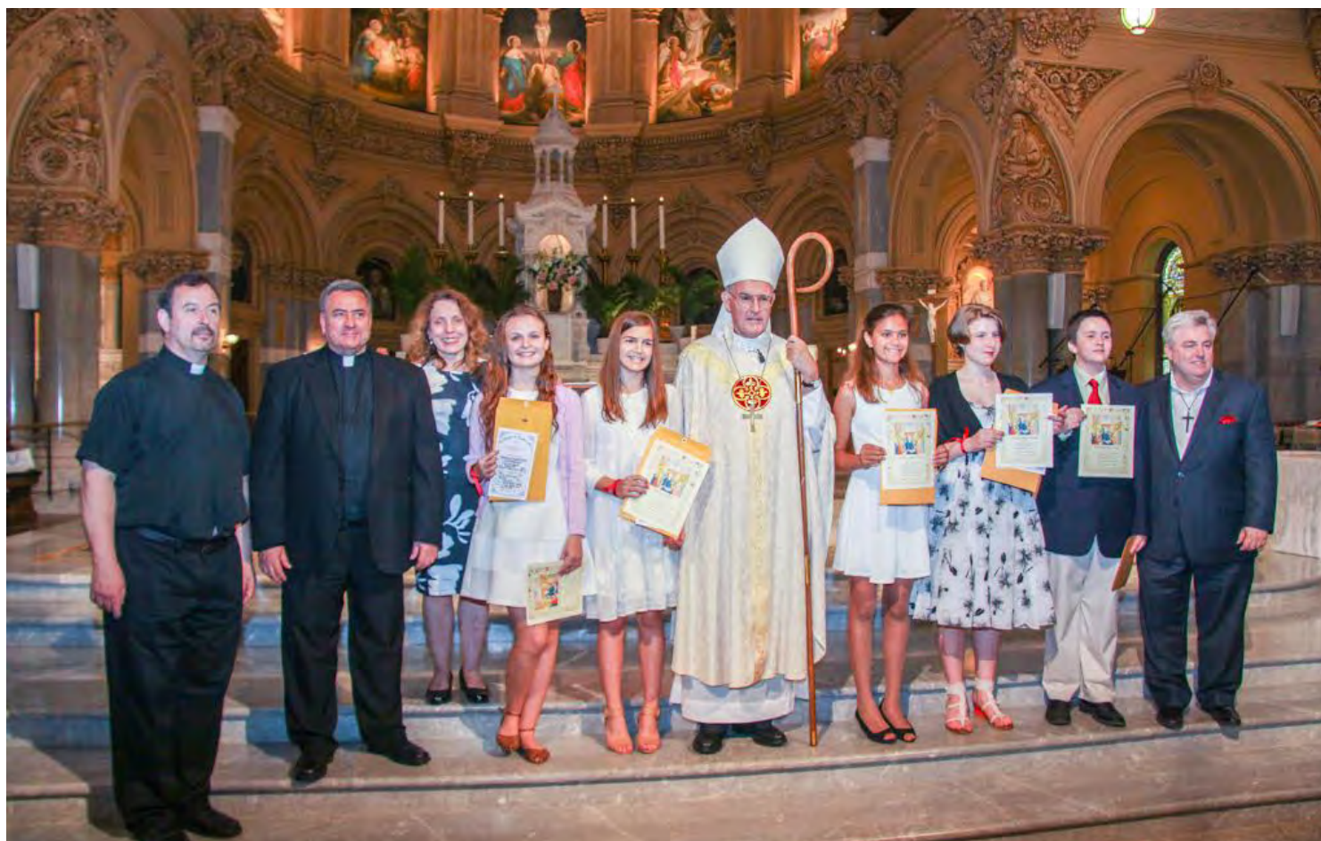
Confirmation Class of 2015

E-Mail Address: StFrancisXavier@sfxavier.org • Website: www.sfxavier.org