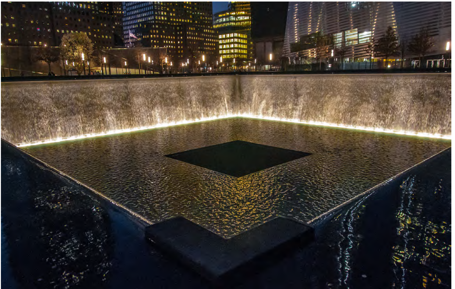
Memorial's South Pool at night - National September 11 Memorial & Museum.

Mailing Address: 55 West 15 th Street, New York, NY 10011-6801 (Wheelchair Accessible 55 West 15 th Street - All Masses are Handicapped Accessible) E-Mail Address: StFrancisXavier@sfxavier.org • Website: www.sfxavier.org