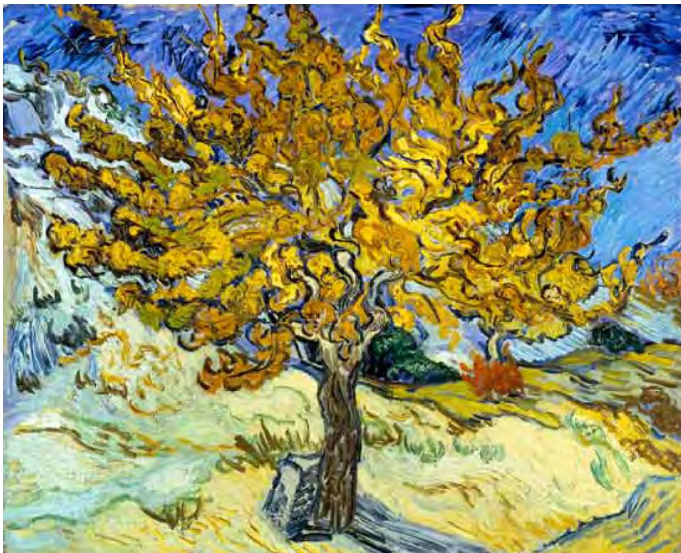
Mulberry Tree, 1889 (oil on canvas), Gogh, Vincent van (1853-90)

E-Mail Address: StFrancisXavier@sfxavier.org • Website: www.sfxavier.org