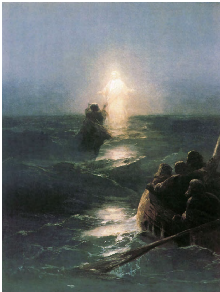
Jesus walks on water- Ivan Aivazovsky

E-Mail Address: StFrancisXavier@sfxavier.org • Website: www.sfxavier.org